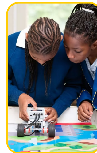
Robotics & Coding